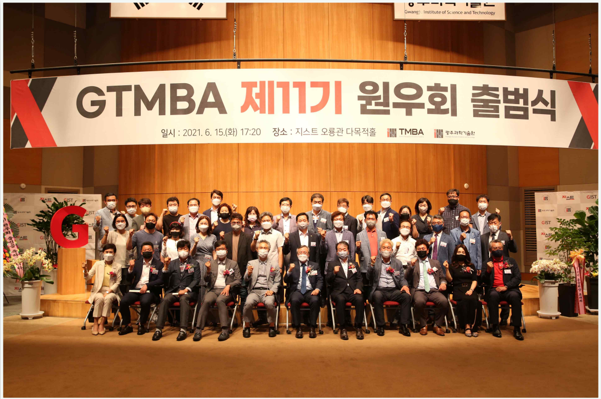
▲ GIST Techno Management Business Academy 11th Alumni Association inaugural ceremony