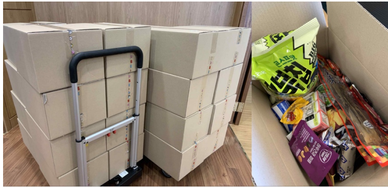
(Photo 1) Comfort items given with a letter to freshmen from Daegu and North Gyeongsang Province who are quarantined